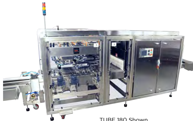
TUBE 180 Shown