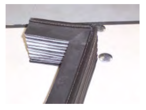
Sewn bellows boot used for State Rail Authority