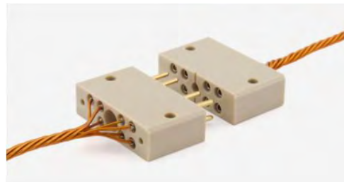
VCC7 - In-Vacuum Connectors