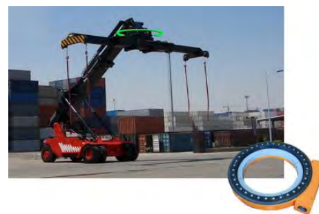
Slewing drive or bearing can be used in container crane.