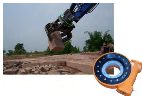
SE WE series of products are widely applied on timber grab, stone