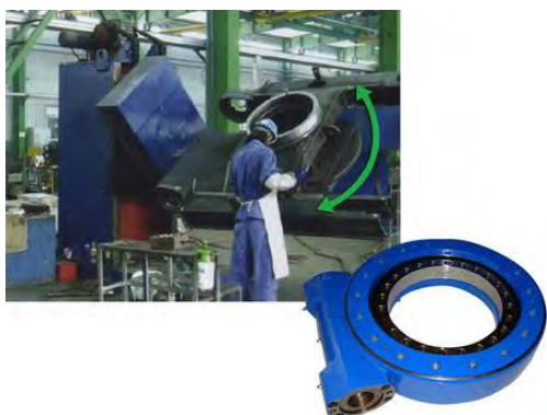
The rotation of welding machine is drove by SE series of slewing drives.