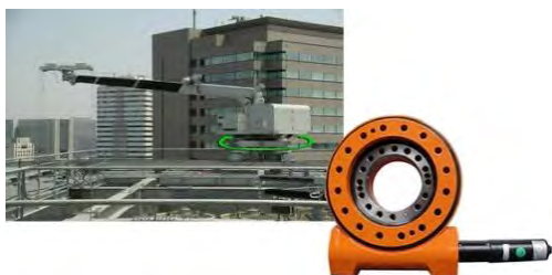
SE series of products and slewing bearing are applied on window cleaning devices.