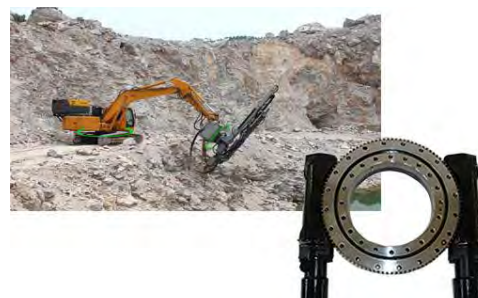
SE14-2 dual worm slewing drives is widely applied on the rotation joint.