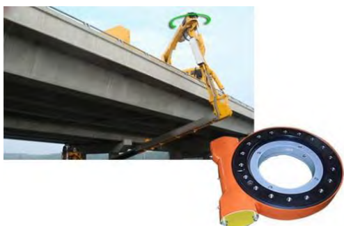
WE series of products is suitable to the joint rotation of turning arm.