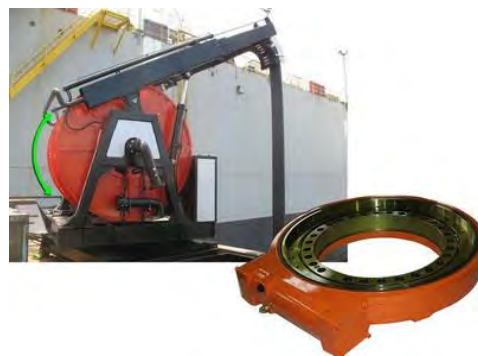
HSE series of slewing drive is approved in this field.