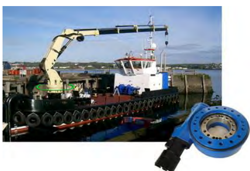
The enclosed slewing drives are used in different models of lifting cranes through special processing.