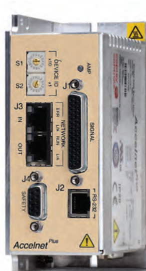
Accelnet PLUS R40