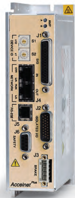
Accelnet PLUS R41