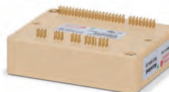
Stepnet PLUS R52