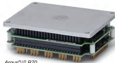
Argus PLUS R70

Argus PLUS modules set new levels of performance, connectivity, and flexibility. It operates as a CAN node using the CANopen protocol of DSP-402 for motion control devices. A wide range of absolute encoders are supported. Both isolated and high-speed non-isolated I/O are provided.