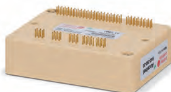
Accelnet PLUS R42