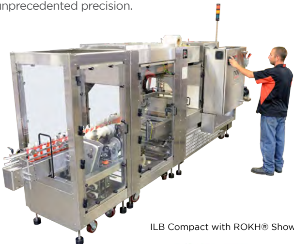
ILB Compact with ROKH® Shown